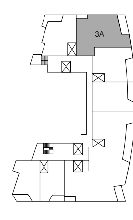
TOWER RESIDENCES KEYPLAN